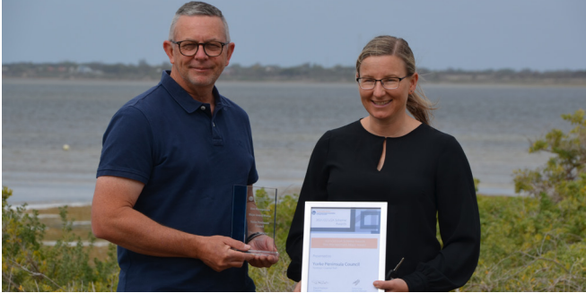
2021/22 LGA Scheme Awards Risk Management Major Award