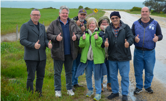
Funding received for North Coast Road, Point Turton