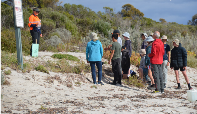
Prince Alfred College Students help with the revegetation of Flaherty Beach