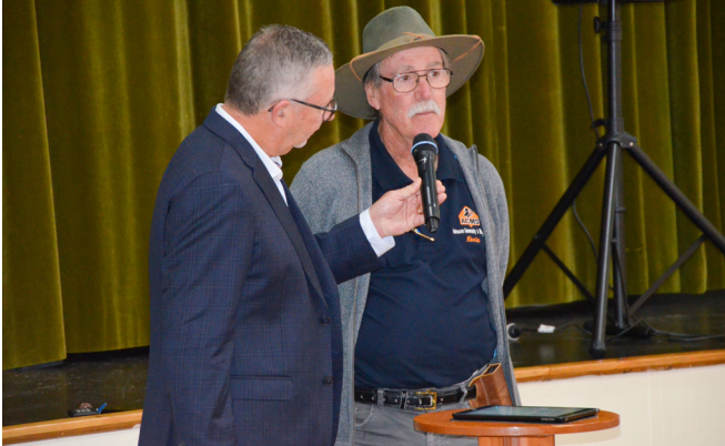
National Volunteer Week - Morning Tea