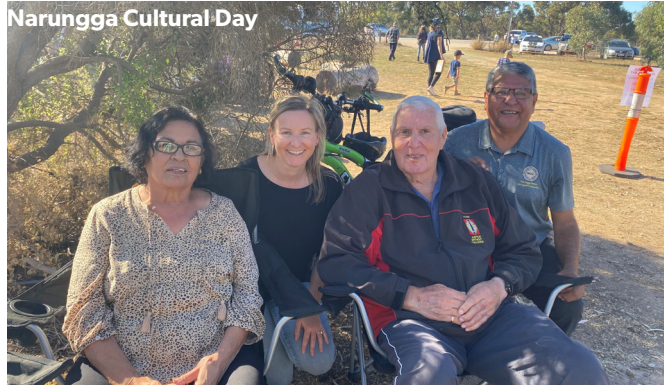
Narungga Cultural Day