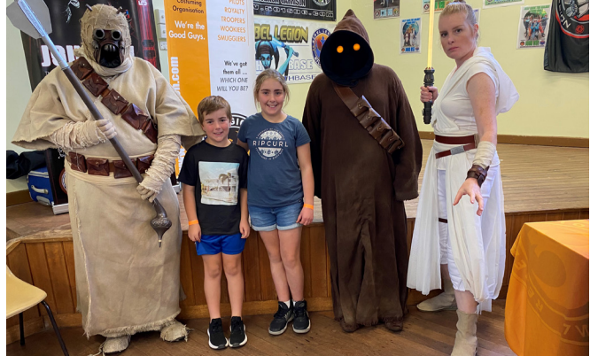
YorKON Games Convention