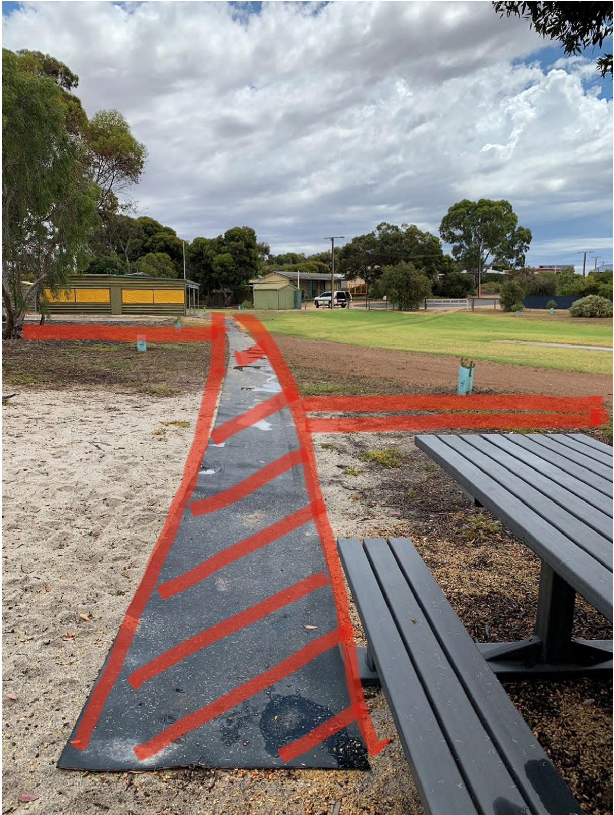
Fig. 6 Proposed Access Path Picnic Table to Shelter View