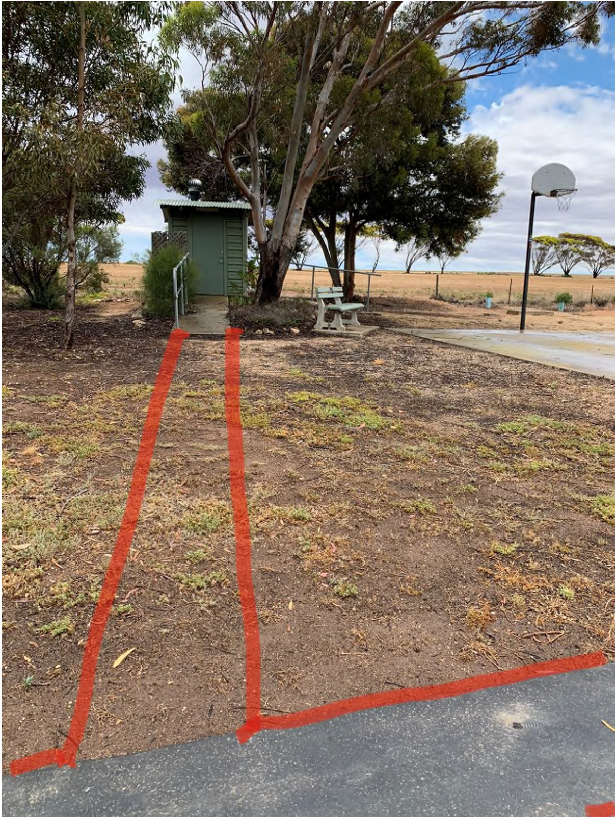
Fig. 7 Proposed Access Path to All Access Toilet Facility View