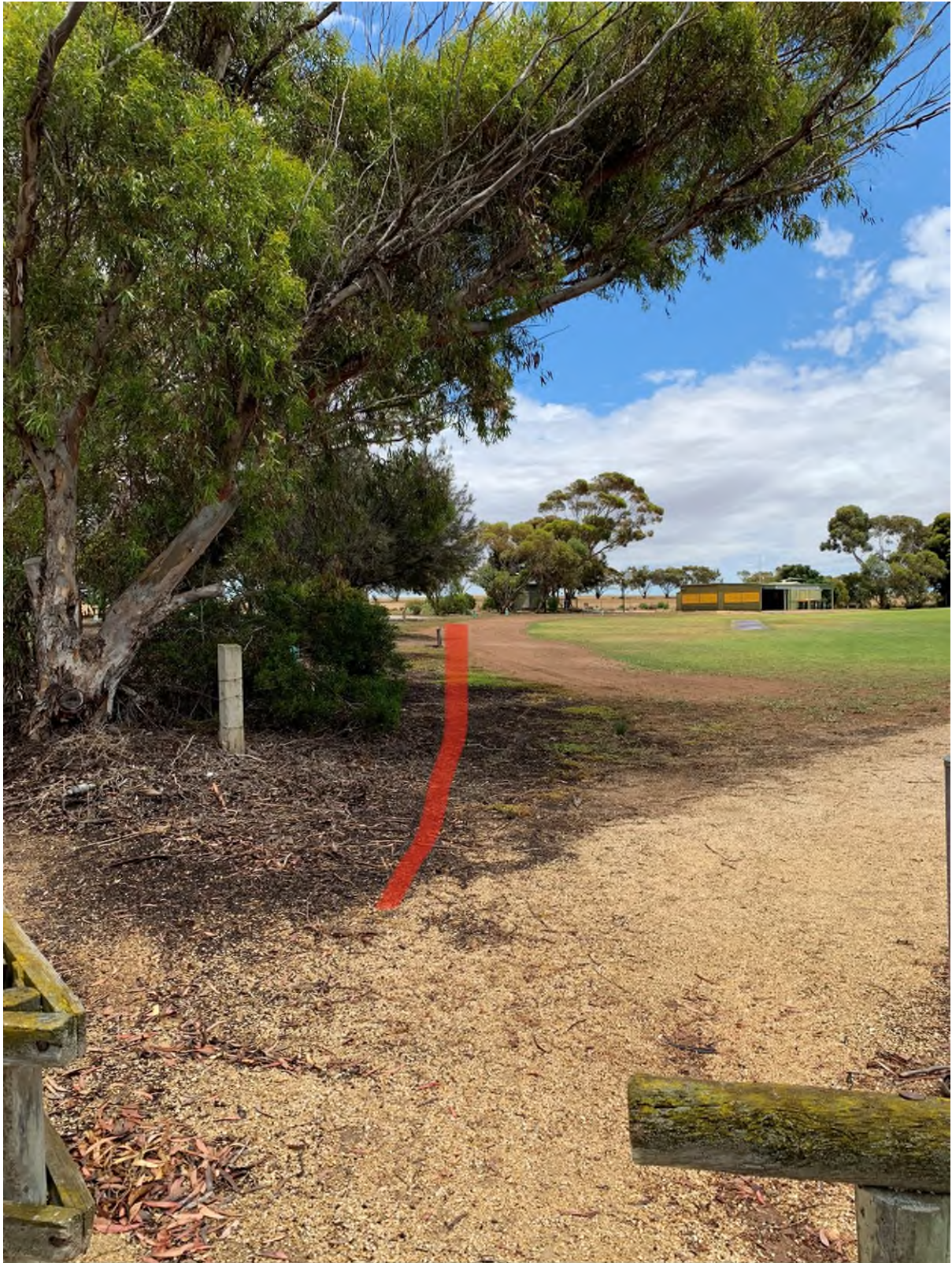
Fig. 4 Proposed Access Path SE Reserve Entry to Picnic Table View