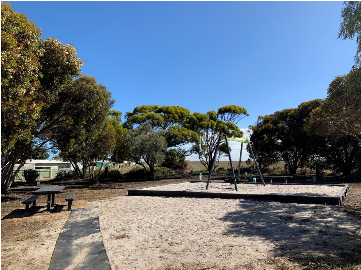
Fig 1. Existing Tiddy Widdy Beach Southern Reserve Facilities

Over recent years, the recreational and social opportunities for individuals with physical disability have been enhanced through YP Council support for the installation of a disability access swing and a picnic table structure designed for access by people who use a wheelchair. There has also been previous support to upgrade the TWB Southern Reserve toilet facility to include disability access features.