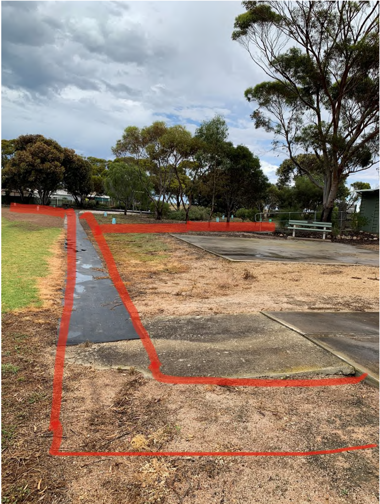
Fig. 8 Proposed Access Path Shelter to Picnic Table View. Proposed Path to Toilet illustrated.