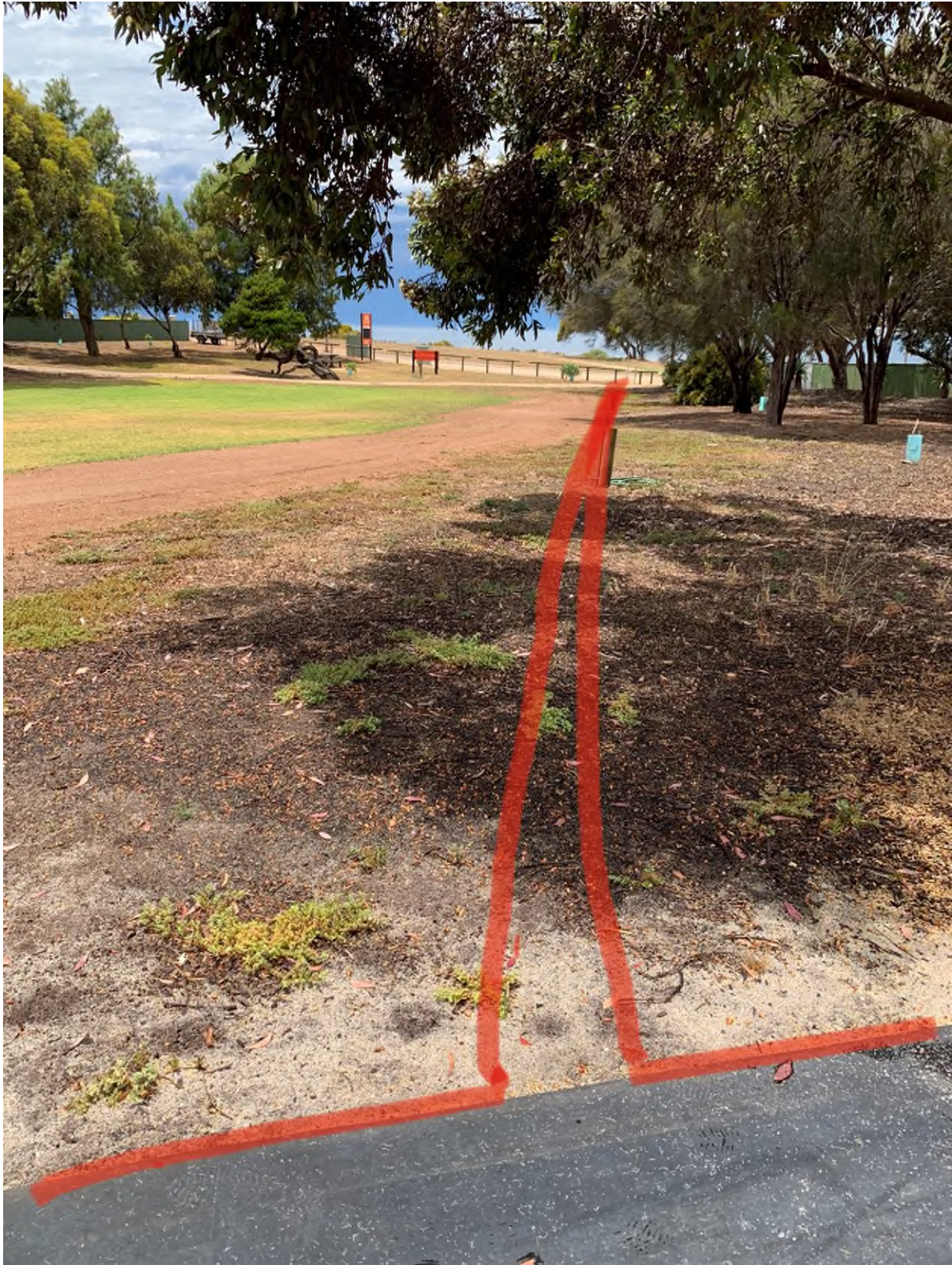
Fig. 5 Proposed Access Path Picnic Table to SE Reserve Entry View