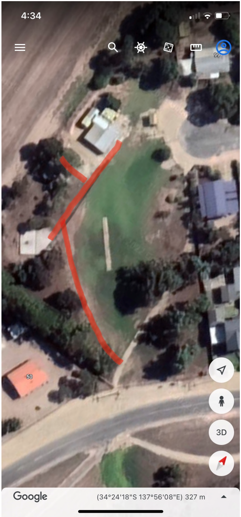
Fig. 3 Proposed Access Pathway Illustrated Schematically on Google Earth View