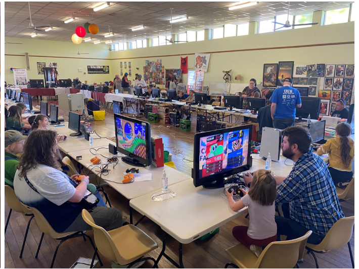
GAMES GALORE... There were many console games on offer at YorkKON.