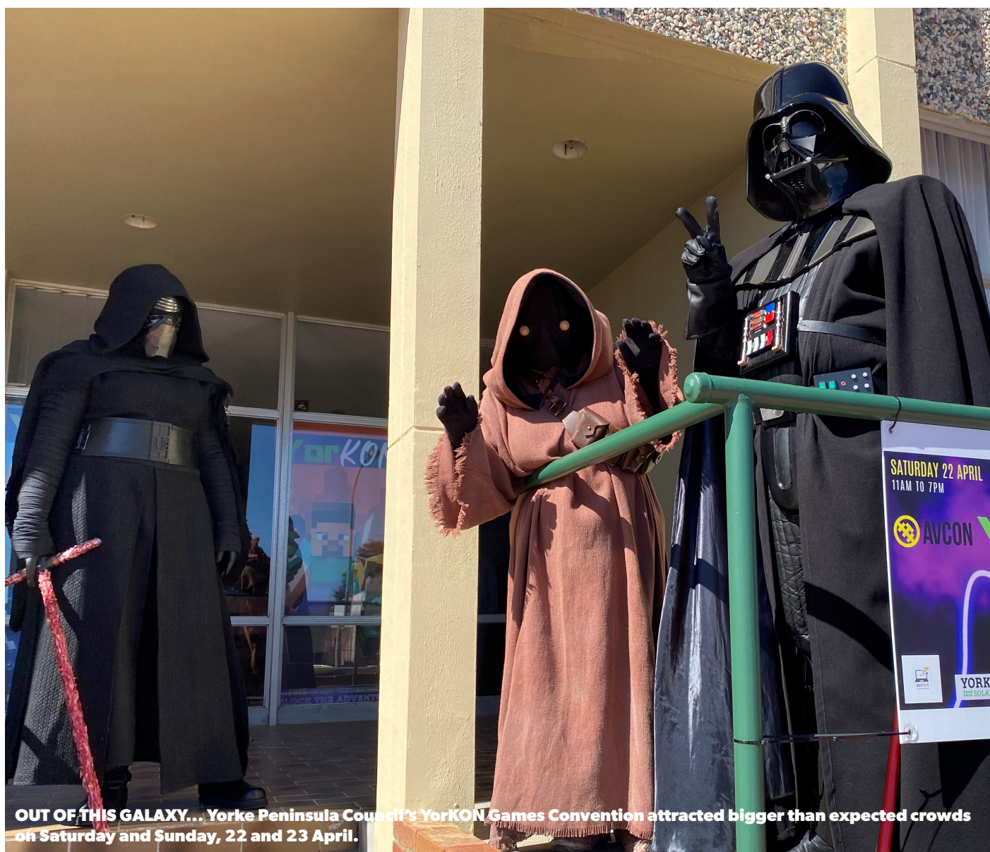
OUT OF THIS GALAXY... Yorke Peninsula Council's YorKON Games Convention attracted bigger than expected crowds on Saturday and Sunday, 22 and 23 April.

"We would like to thank our event partners which include Team AvCon, Copper Coast Table Top Gamers, Retrospekt, Little Adventurers and Southern Dewback Garrison – 501st Legion, Cold Creature Art, Ben's IT Communications, Maitland and District Progress Association, Oh My Grill and Yorke Solar."