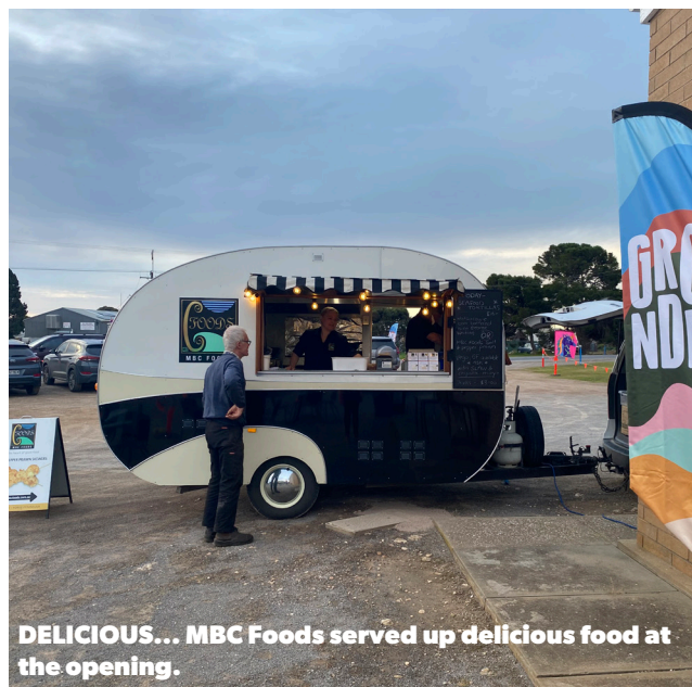
DELICIOUS... MBC Foods served up delicious food at the opening.