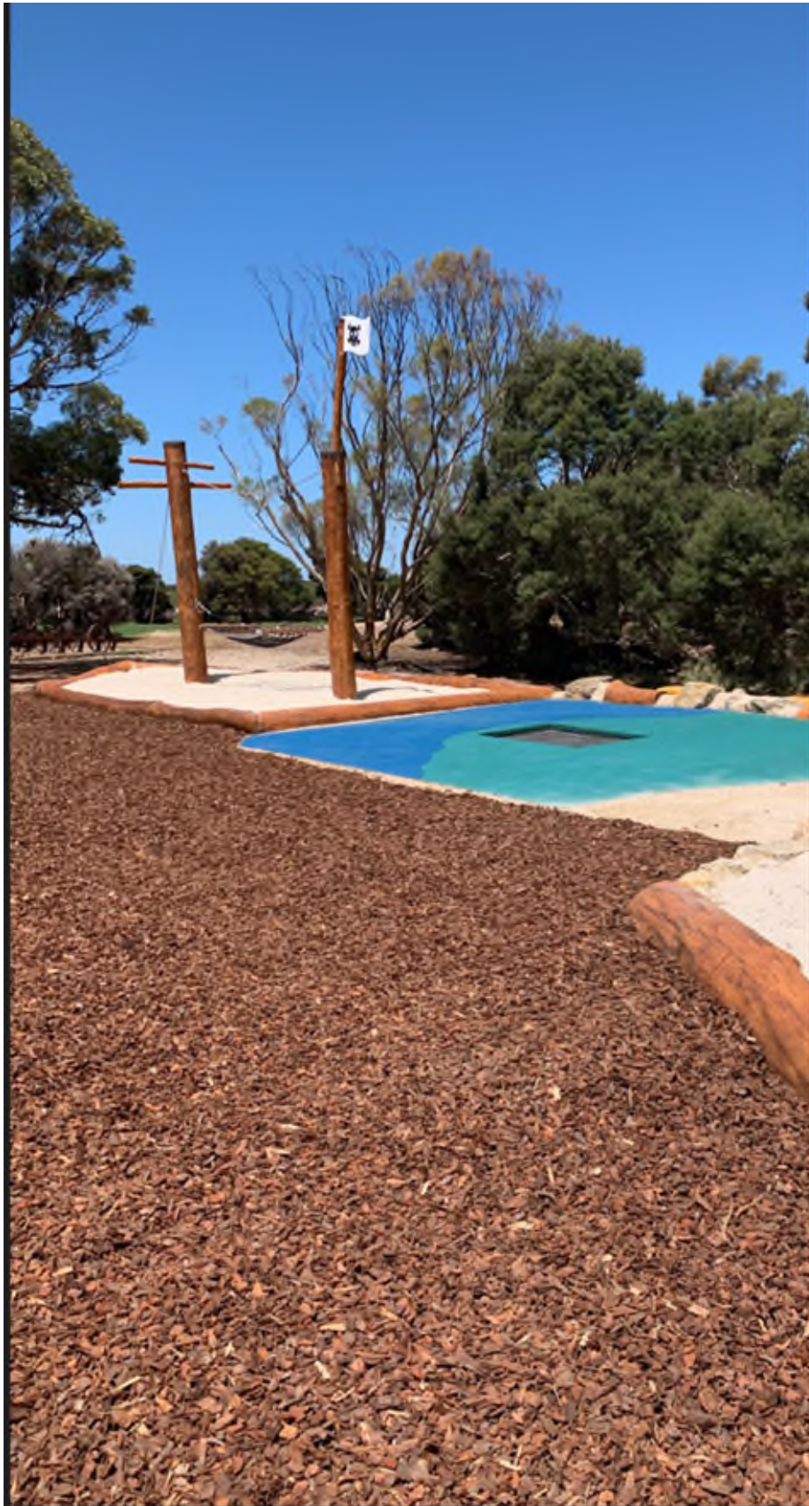
Nature Play Outdoor Area Depicting Air Jumper