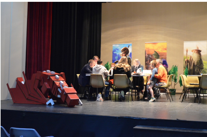
CONCENTRATION... The Dungeons and Dragons room was a hit amongst those who attended YorkKON.