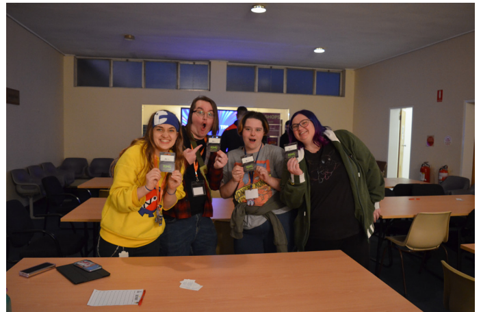
QUIZ... An enthusiastic group test their knowledge at the inaugural quiz night.