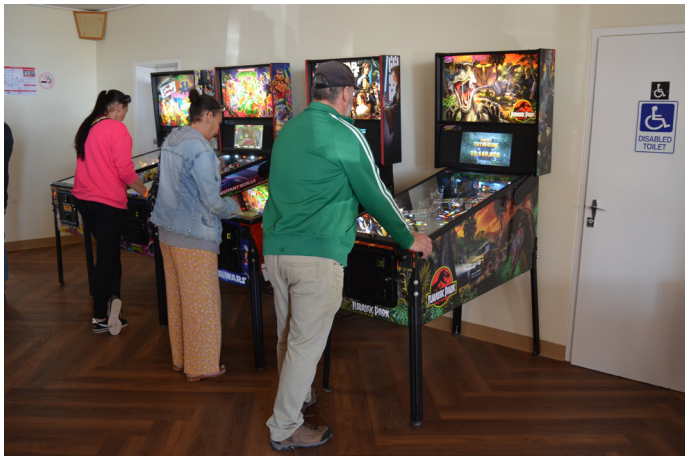
ARCADE... There was plenty of arcade fun at YorkKON.