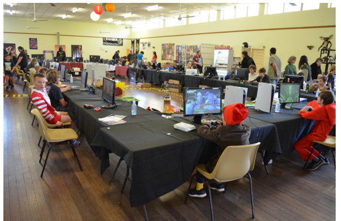
FUN AND GAMES... There was a variety of video games on offer at YorkKON.