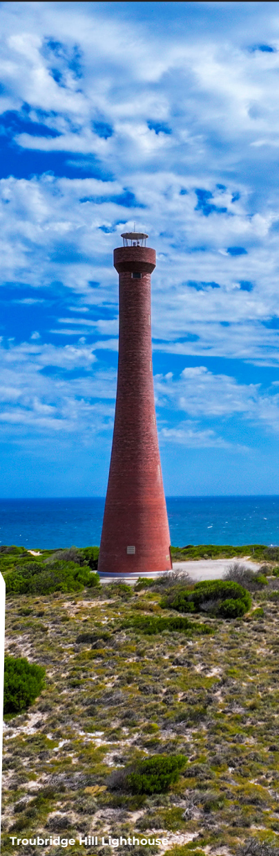
Troubridge Hill Lighthouse