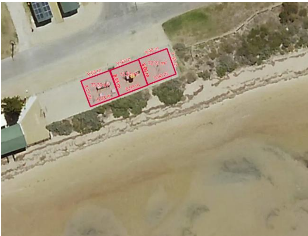
Figure 1 Proposed location – current playground space, along the Parade

As part of the Algal Bloom Summer Plan and other support packages, the State and Federal Governments are investing to support local coastal communities. Port Clinton Progress Association has been approved to receive funding for this project.