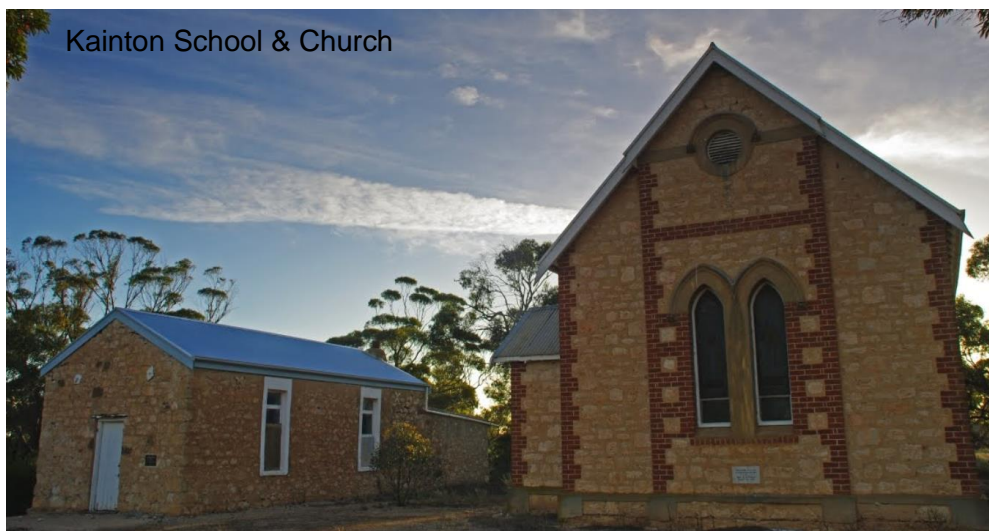
Kainton School & Church