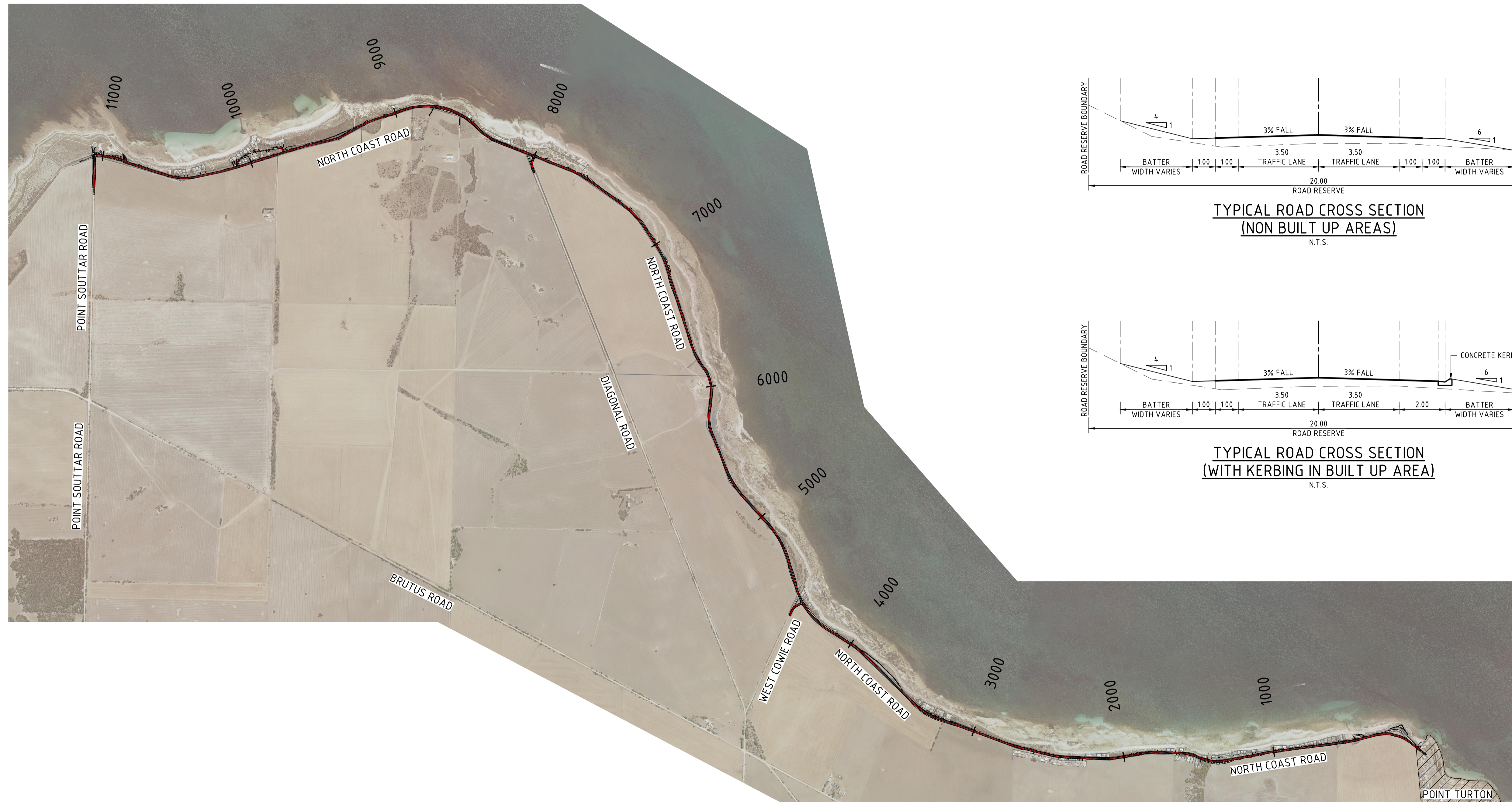
LOCALITY PLAN N.T.S.